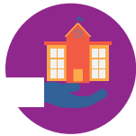
Supports that School Provides