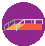
Home Modifications and Supplies