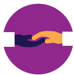
Attendant Care Support and skill development with day to day living provided by a personal support worker (PSW) or agency.