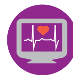
Specialized Medical Equipment and Supplies