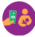
Payment to Parents to Take Care of their Children