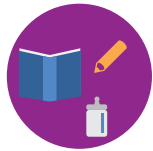
Child care (aka baby sitting)