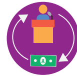
Reimbursements: for supplies, trainings and materials made directly to individuals/families. Payments must be made to a vendor of services, which includes approved PSW's.