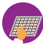
Assistive Devices/ Technology