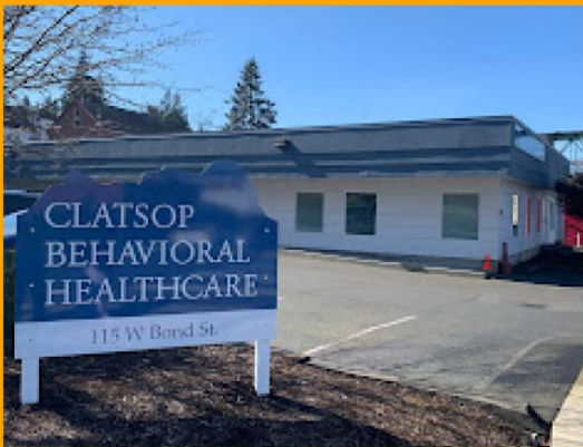
The CBH Rapid Access Clinic, located at 115 W Bond Street in Astoria Oregon.

Individuals under 17 who are in need of an urgent appointment may visit the outpatient clinic at 486 12th Street in Astoria to be seen during normal business hours.