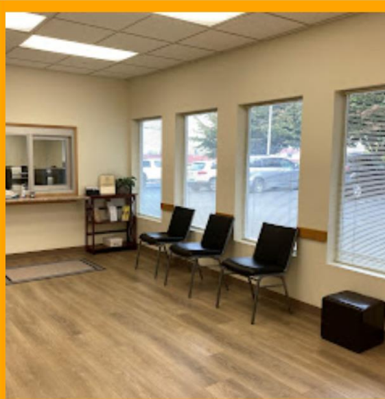
The client waiting area inside the Rapid Access Clinic in Astoria Oregon.